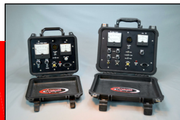
PORTABLE FPT / CCL PANELS (SEALED PELICAN CASES, ABILITY TO LOG IN WARRIOR)