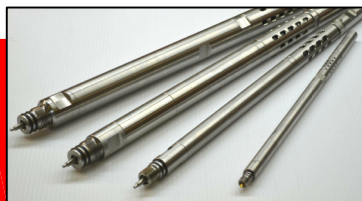
FPT SENSORS 1 5/8", 1 3/8", 1", & 11/16" O.D.