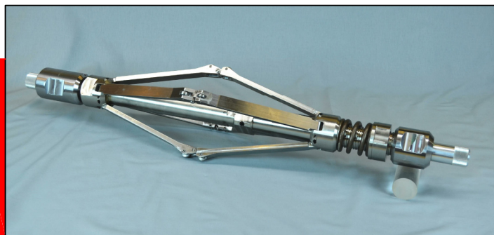
2 3/4" ADJUSTABLE ROLLER CENTRALIZER